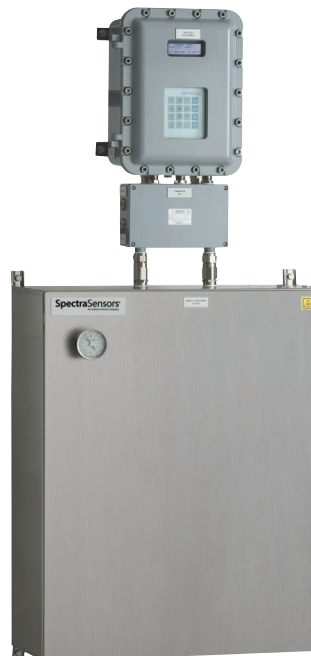
SS2100a with Sample Conditioning System

Reliable Trustworthy measurements are vital in process analytical applications. The TDLAS sensor is unaffected by contaminants and corrosives since the gas stream never touches the laser or detector. The SS2100a requires little regular maintenance and does not need recalibration or periodic replacement parts due to the inherent stability of TDLAS technology.